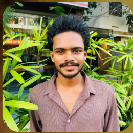
FIHAN C S